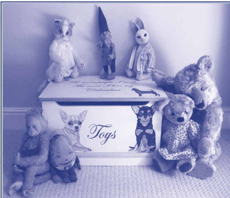
Showcasing 'Pegasus of Sussex'

Hand painted nursery furniture and accessories, and antique children's toys.